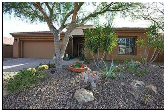
Front of home