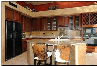
Lrg Open Family Rm w/ Bang-Olufson Sound Sys