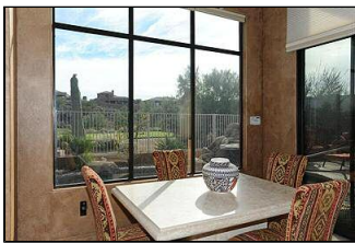
Quaint Breakfast area w/ views