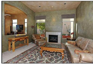
Open Living Room w/ details and arch