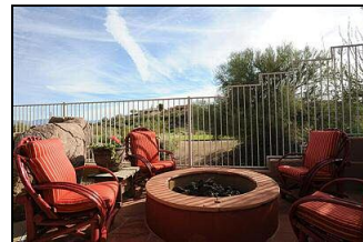
Firepit and Sedona Flagstone Patio