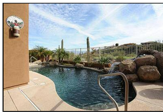
Pebble-tec Pool and Spa w/ Water Feature