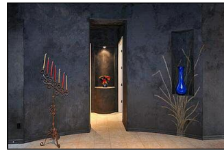
Specialty paint throughout home