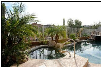
Relax in this gorgeous spa