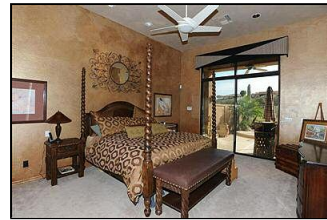
Lrg Open Family Rm w/ Bang-Olufson Sound Sys