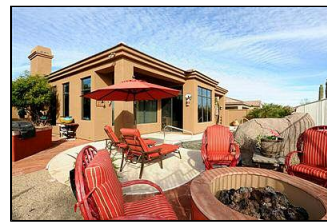
Lrg lot w/ lots of room for entertaining