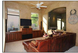
Lrg Open Family Rm w/ Bang-Olufson Sound Sys