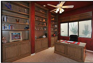
Lrg Open Family Rm w/ Bang-Olufson Sound Sys