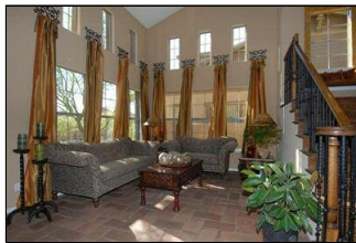
High Ceilings and Bright Living Room