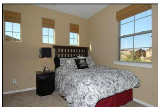
Third Guest Room