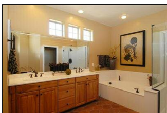
Gorgeous Master Bath