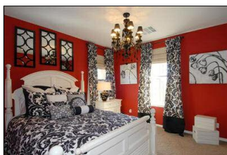
Guest Room En Suite