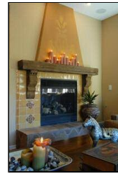
Fireplace encased in Talavera Tile