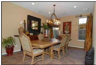
Oversized Dining Room