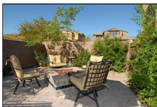
Firepit for entertaining