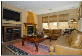
Family Room for Relaxing