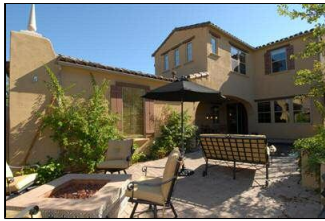
Gorgeous Backyard Retreat

Cell: 480-242-3880 Email: barbaralane@kw.com Website: barbaralane.point2agent.com