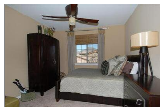
2nd Guest Room