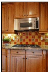
Lovely Tilework throughout